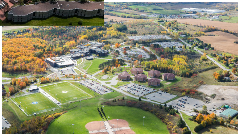
Fleming Campus ▶