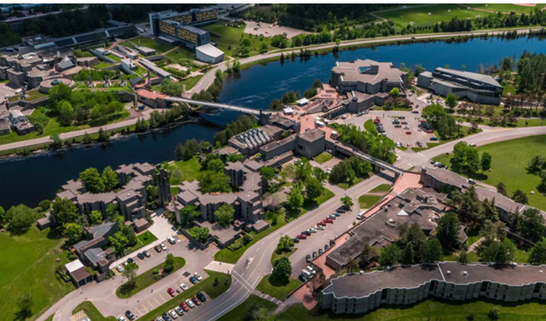
◀ Trent Campus

The Fleming College Career Services team and Trent University CareerSpace can help you explore career options by identifying your skills, values and interests, getting information about the labour market, and researching related college programs. They will also help you with the process of applying for jobs, including critiquing a resume and cover letter and advise you on Networking strategies and Interview preparation.