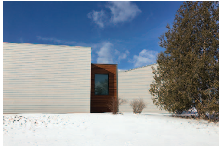
Peterborough Museum & Archives construction completed—south elevation, January 2017.