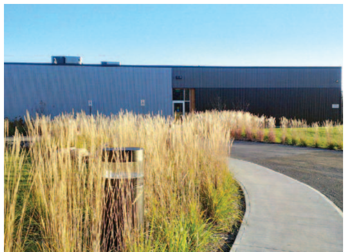
Curatorial Centre, Peterborough Museum & Archives, September 2016.