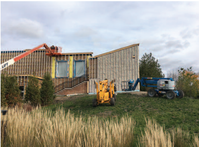
Peterborough Museum & Archives during construction—west elevation, October 2016.