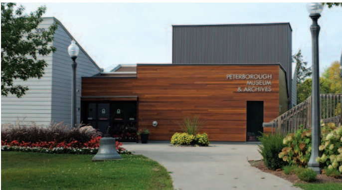
Peterborough Museum & Archives construction completed—east elevation, Summer 2017.