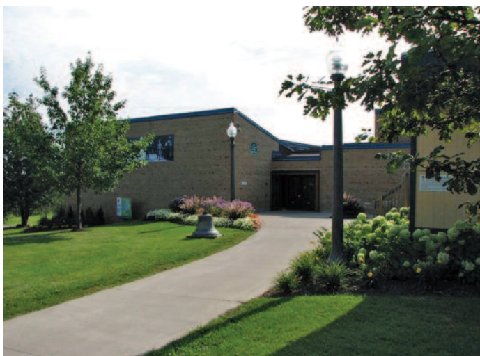
Peterborough Museum & Archives pre-construction—east elevation, August 2016.

Exterior conditions were also creating periods of considerable condensation, which were most noticeable at doors,