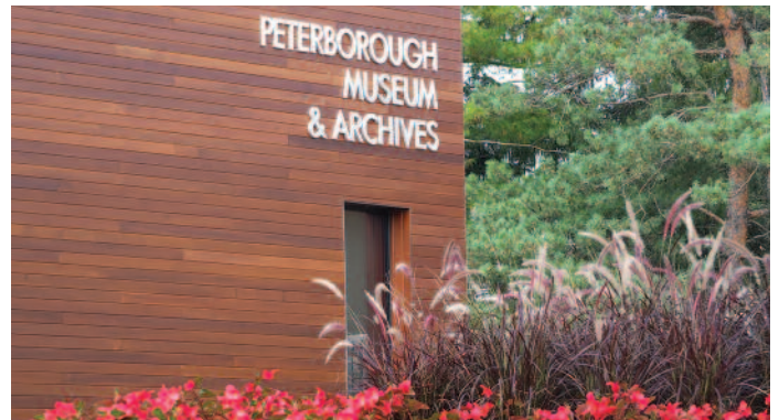
Peterborough Museum & Archives—east elevation, Summer 2017