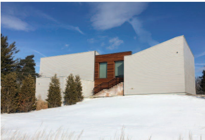
Peterborough Museum & Archives construction completed—west elevation, January 2017.