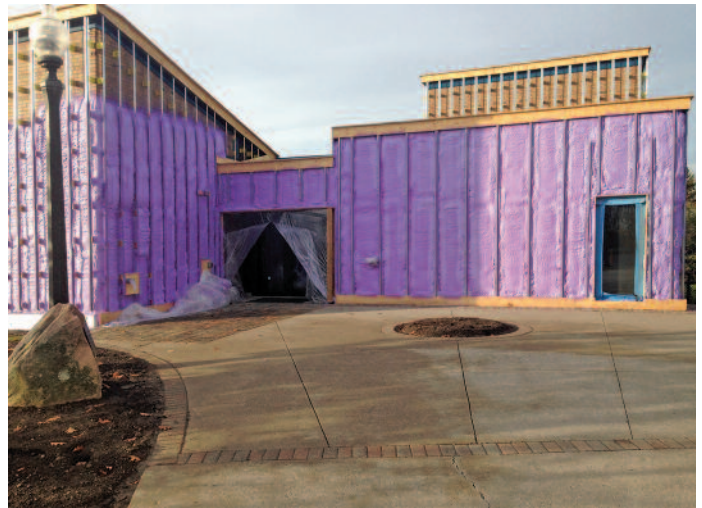
Peterborough Museum & Archives during construction—east elevation, October 2016.