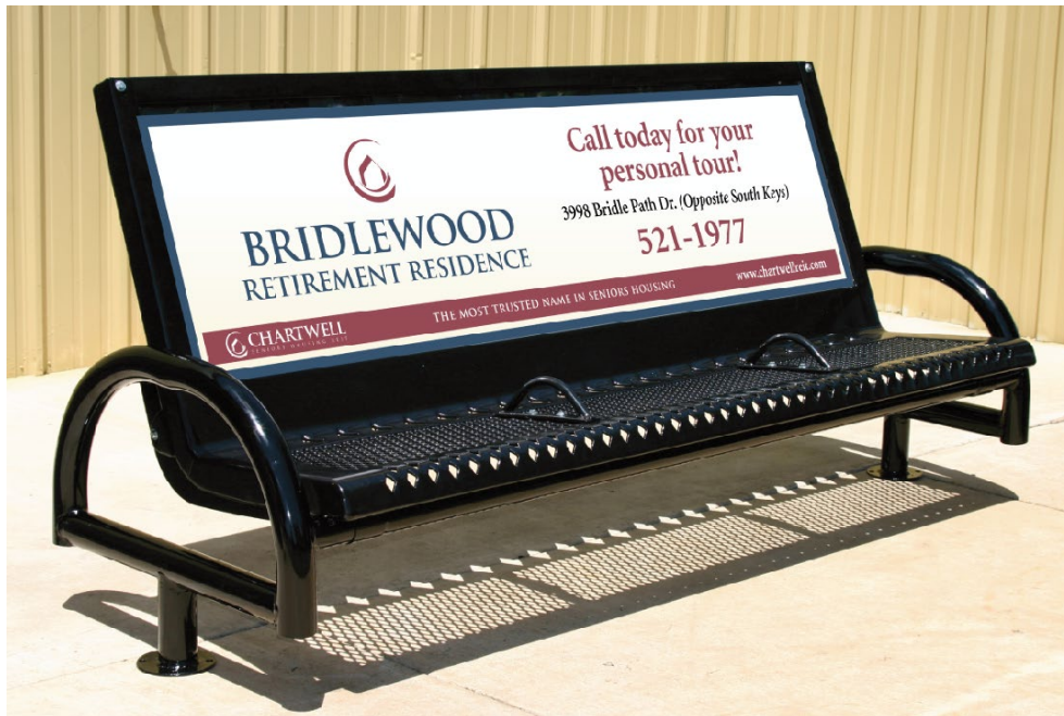
Figure 2: Seats with “concourse”