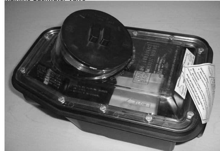
Mainline Backwater Valve

Applications approved will be on a first come first served basis, due to funding limitations. Eligible applications that were accepted or appeals that were awarded are not guaranteed to receive subsidy in the event of program termination or complete expenditure of funding.